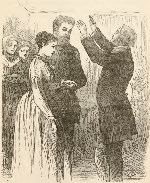
THEN THEY WERE MARRIED. ”

David and Christie went smiling away together, and